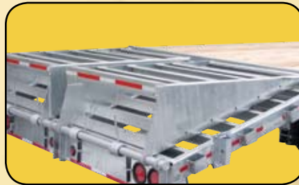
FLIP OVER 40"